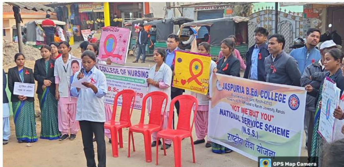
GPS Map Camera