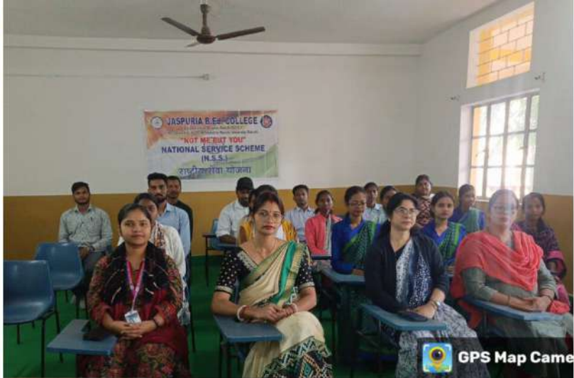
GPS Map Came